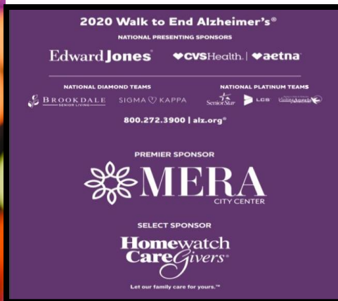
Logo on West Valley Walk Shirt

As a Central AZ sponsor, here were some of your benefits including: